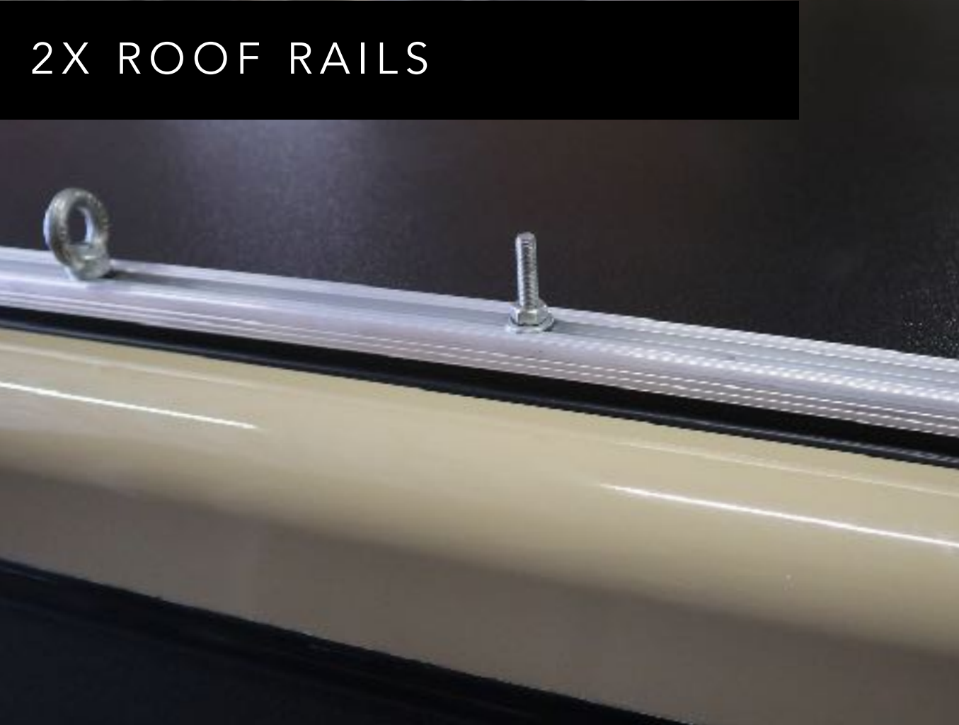
2X ROOF RAILS