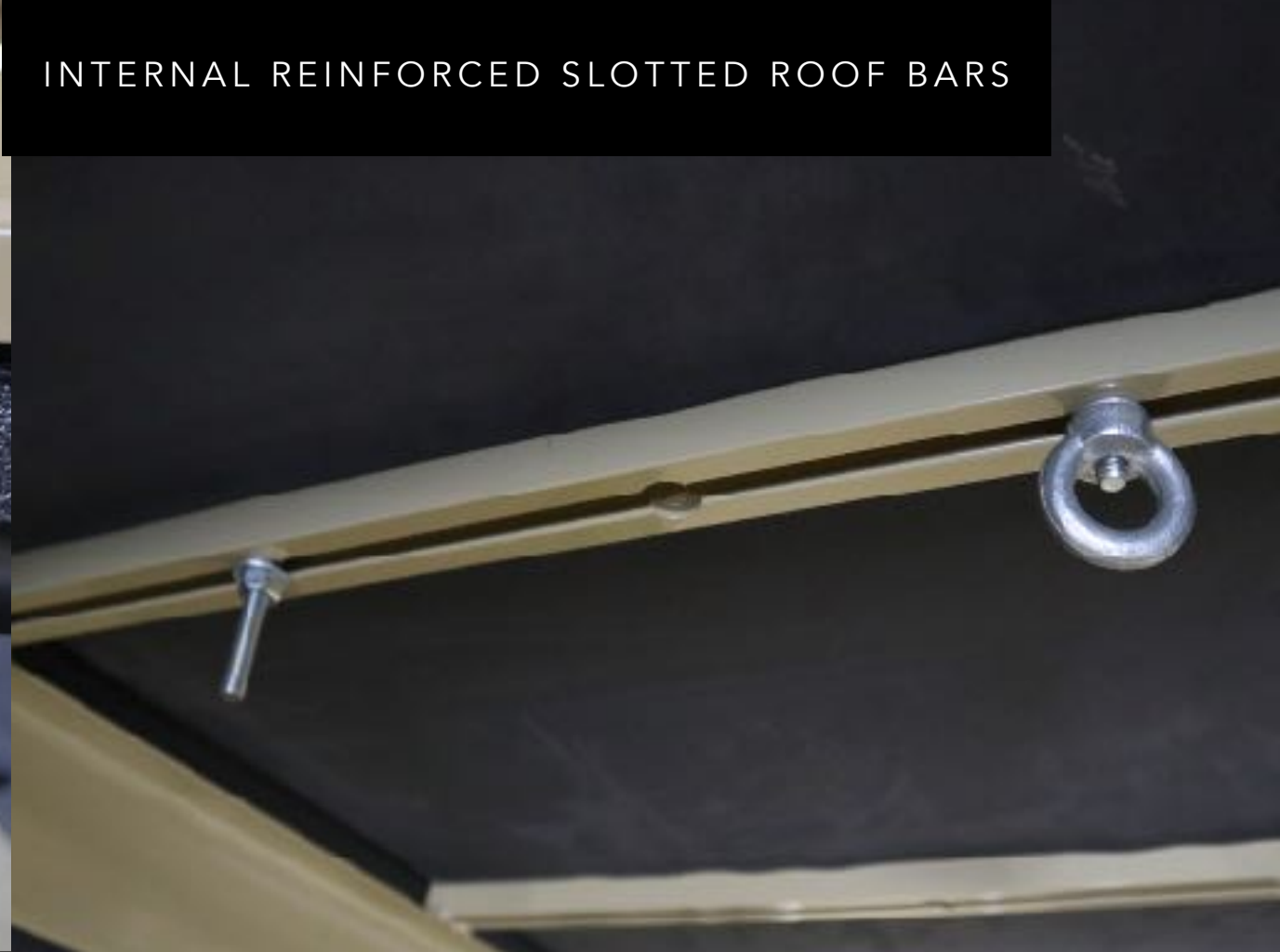
INTERNAL REINFORCED SLOTTED ROOF BARS