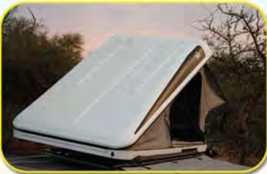
EEZI-AWN'S NEW DART rooftop with Lockable latches