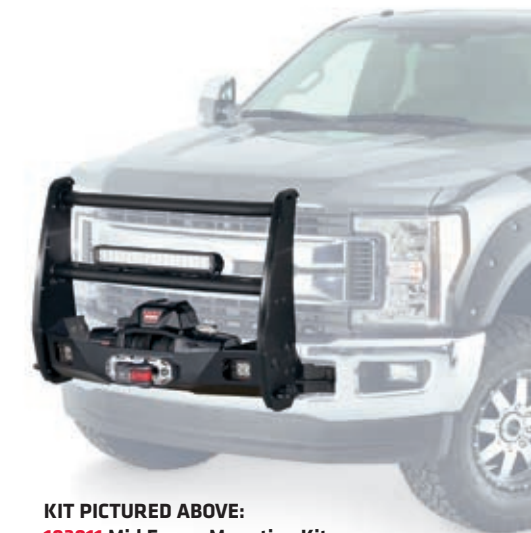
KIT PICTURED ABOVE: 103011 Mid Frame Mounting Kit 102957 Bolt-on center-only tall grille guard