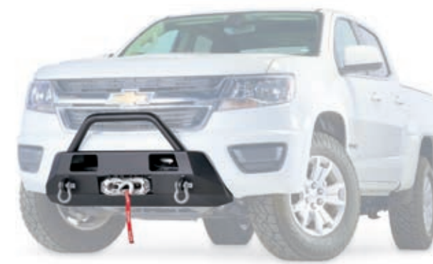
103210* 2015-19 Chevy Colorado