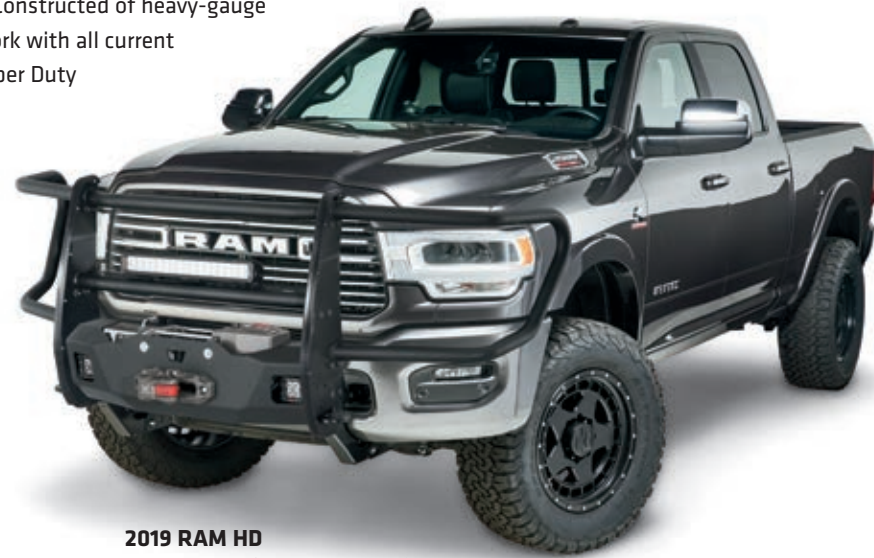
2019 RAM HD 104288 Large frame mounting kit 104821 Bolt-on full grille guard kit, including uprights and headlamp guards