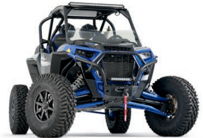
101690 2019 RRZ XP Turbo S