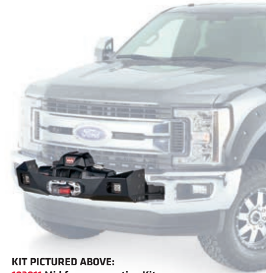
KIT PICTURED ABOVE: 103011 Mid frame mounting Kit