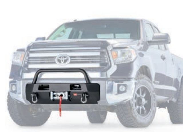
103209* 2014-19 Tundra