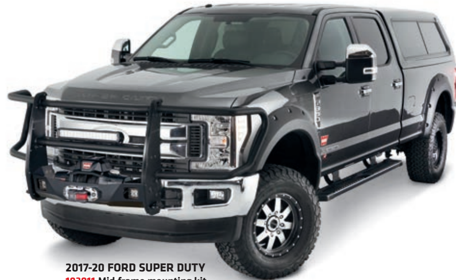
2017-20 FORD SUPER DUTY 103011 Mid frame mounting kit 103012 Bolt-on full grille guard kit, including uprights and headlamp guards

The all-new Trans4mer Gen III features extra welds and fewer bolts for a clean, easy install – no cutting, drilling or grinding. They're also easy to order, with kits that have no more than two part numbers. Constructed of heavy-gauge steel with a durable black powder coated finish to protect against corrosion, these kits work with all current WARN large and mid-frame winches. Available now for the newest RAM, Ranger, and Super Duty trucks. Trans4mer is made in the USA.