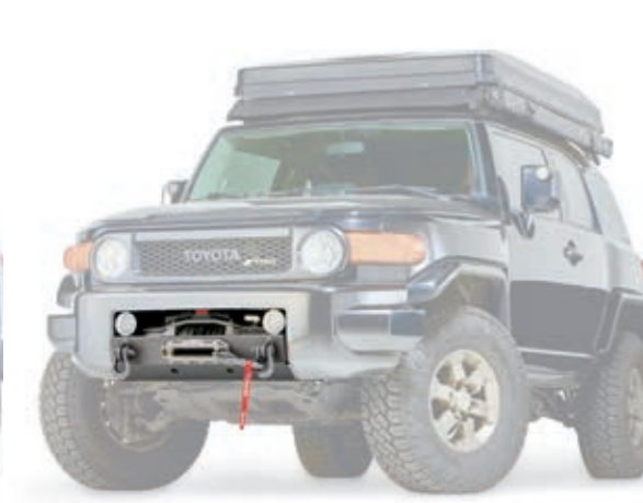
103220* 2006-14 Toyota FJ