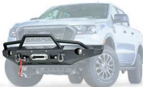
103465 Ascent Front Bumper - 2019 Ford Ranger 104296* Baja Bar