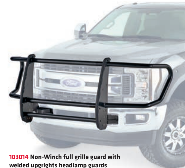
103014 Non-Winch full grille guard with welded uprights headlamp guards