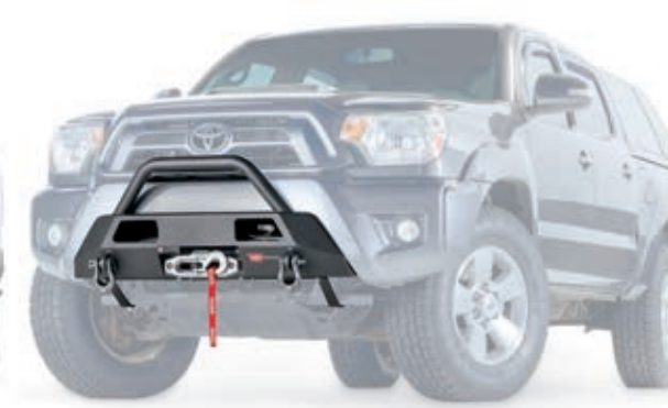
102874 2012-15 Tacoma