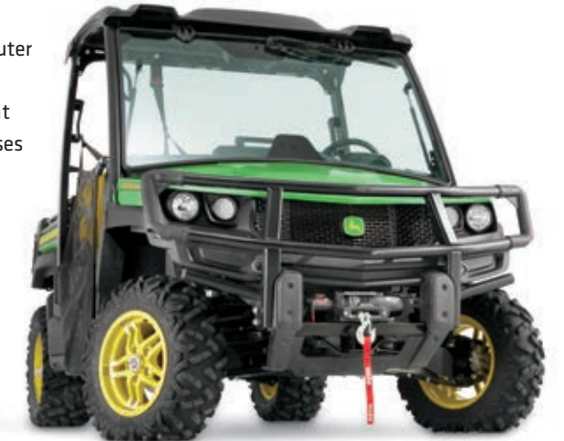
101688 2019 John Deere XUV835