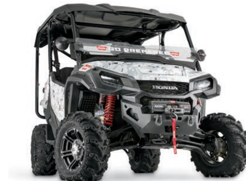
101700 2016-18 Honda Pioneer 1000