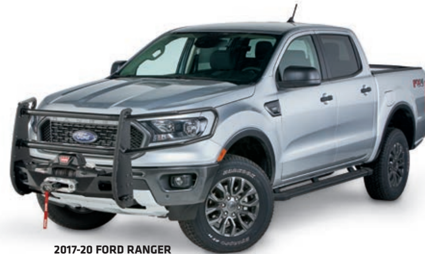
2017-20 FORD RANGER 103322 Mid frame mounting kit 103379 Bolt-on full grille guard kit, including uprights and headlamp guards

Mounting kits are available for both mid and large frame winches.