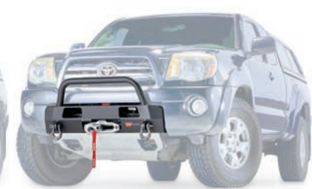
102876 2005-11 Tacoma