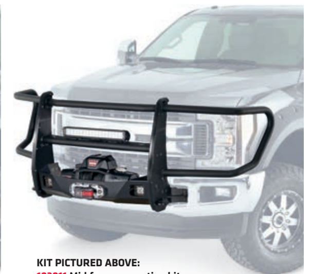
KIT PICTURED ABOVE: 103011 Mid frame mounting kit 103012 Bolt-on full grille guard kit, with uprights & headlamp guards