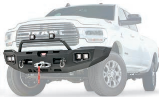
104256* Ascent Front Bumper - 2019 Ram 2500 3500 104825* Baja Bar