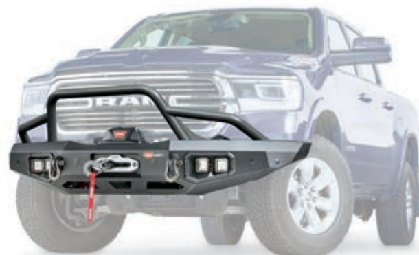
103638* Ascent Front Bumper - 2019 Ram 1500 100475 Baja Bar