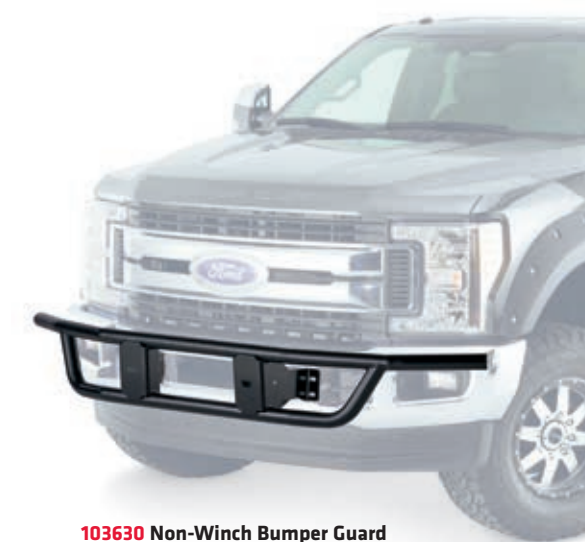
103630 Non-Winch Bumper Guard

See the WARN catalog or website for the full list of available applications and part numbers