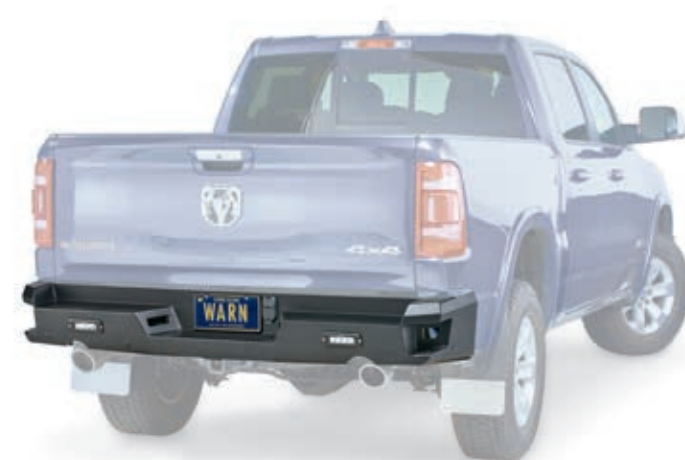
104823* Ascent Rear Bumper - 2019 Ram 1500