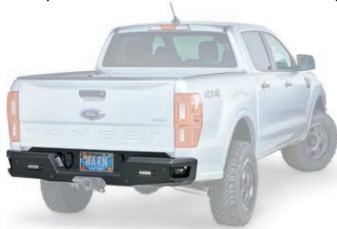
105863* Ascent Rear Bumper - 2019 Ford Ranger